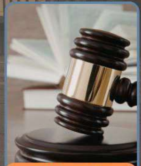
REGULATION AND COMPLIANCE

The 2026 SAIBPP Annual Convention will be structured around four flagship sector conversations, each anchored to a strategic transformation pillar reflecting the most pressing structural challenges within South Africa's property and built environment sector. These pillars will inform the panel discussions, plenary sessions, convention resolutions and the priorities for SAIBPP all the way to convention 2027.