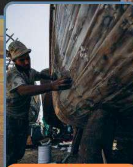
SKILLS AND PROFESSIONALISATION